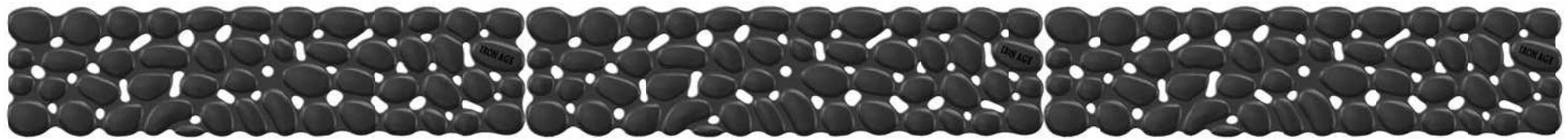
3 GRATES ARRAYED SCALE 1 : 6